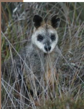
What's happening in Upper Owens Valley?