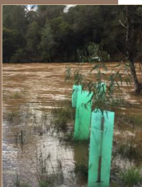
River red gums getting a good Ovens River soaking

We acknowledge the Taungurung and Dhudhuroa Traditional Custodians of the land on which we work and learn and pay our respects to their Elders past, present and future.