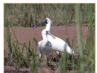
Colonial nester –Royal spoonbill