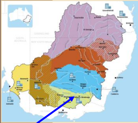
UOVL in Murray Darling Basin

The Forums were created by the MDBA to utilise the knowledge and experience of Basin communities. The forum participants are expected to increase their knowledge of the science of their region and contribute to MDBA science and monitoring programs.