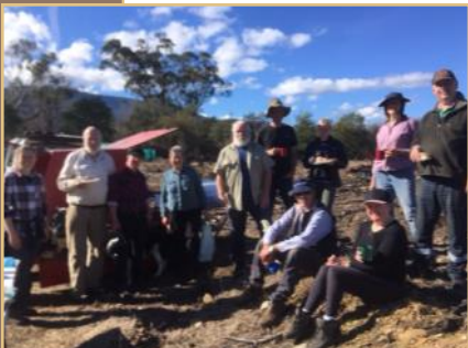
Members enjoying lunch after a big morning planting River red gums