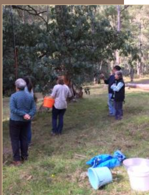
Collecting Omeo gum seed

Construction of a gravel bike path through the Germantown Reserve is commencing soon. It is anticipated that the path will be covered with an asphalt sealer in November. The Working with Children checks for all volunteers on Parks Victoria land have been delayed for now.