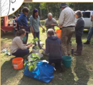
UOVLG collecting & sorting E.neglecta seeds