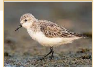
Migratory wader-Red necked stint