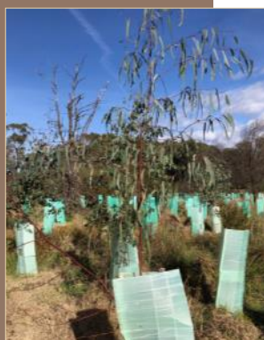
Trees growing well