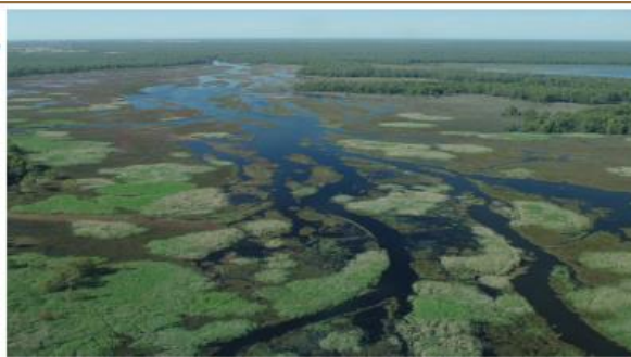
Barmah-Millewa Forest (MDBA)