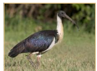
Large wader -Straw necked ibis